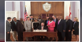
Legislative Session 2016