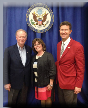
Election Assistance Commission Meeting in California