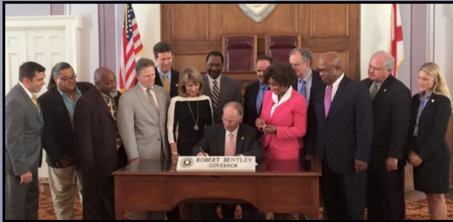
Governor Bentley signing SB 186 on June 28, 2016.