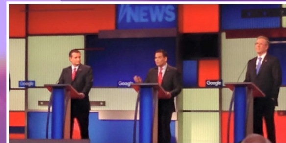
*Ted Cruz, Marco Rubio, and Jeb Bush in Iowa's 2016 Republican Presidential debate.