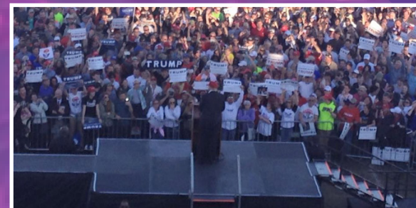
*Donald Trump's last campaign stop in Huntsville, AL on Feb. 28, 2016.